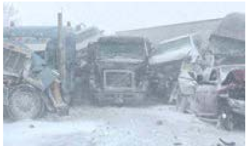
The Nebraska State Patrol handled a variety of traffic incidents in February due to blizzards including one that involved nine semis on I-80 near Aurora on Feb. 19