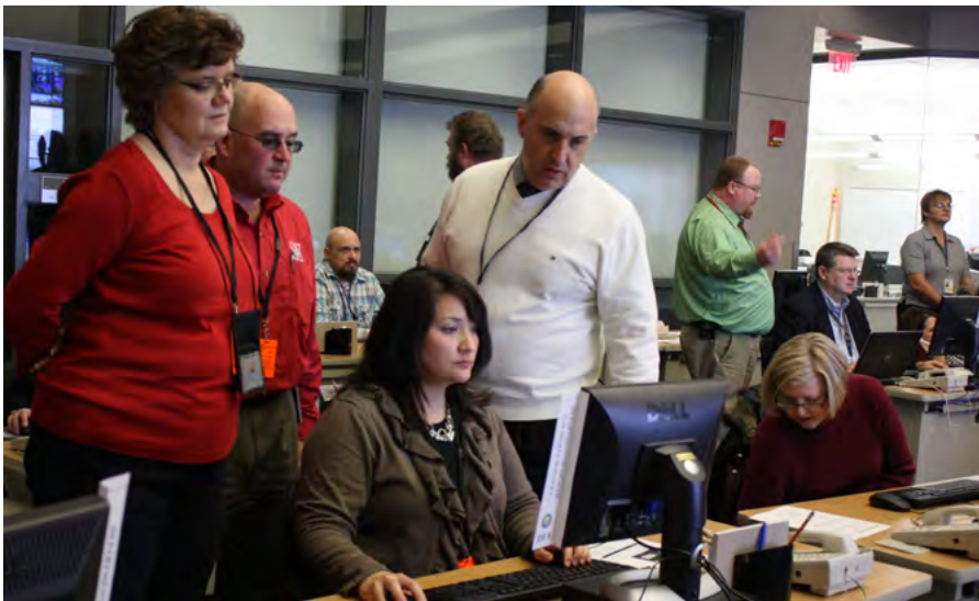
Call-Up Exercise Conducted Nebraska Emergency Management Agency conducted an exercise Jan. 3 of its call-up procedures for activation of its new emergency operations center. Representatives from the essential support functions agencies, and organizations who would report to the facility following a disaster, responded to the facility in a test of security, check-in procedures and connectivity.