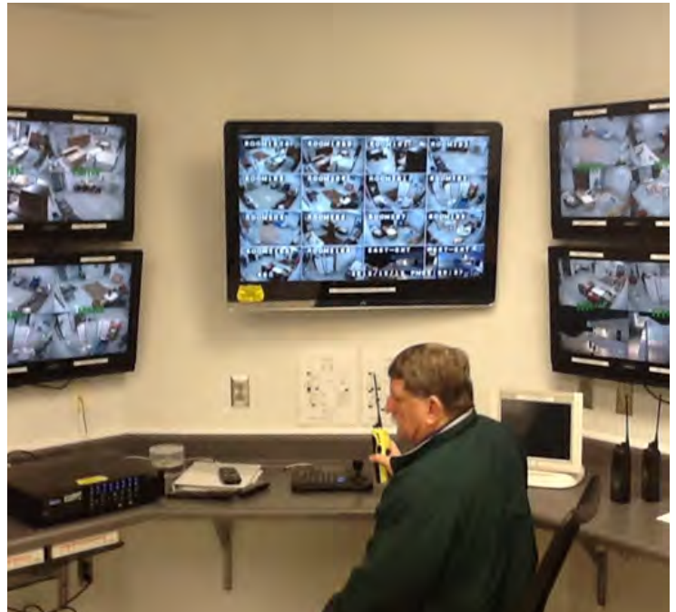
A control operator at the Center for Domestic Preparedness provides monitors training rooms.