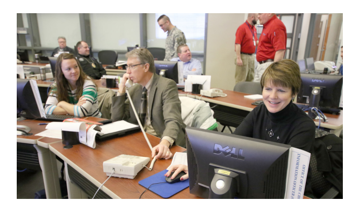
Nebraska Emergency Management Agency